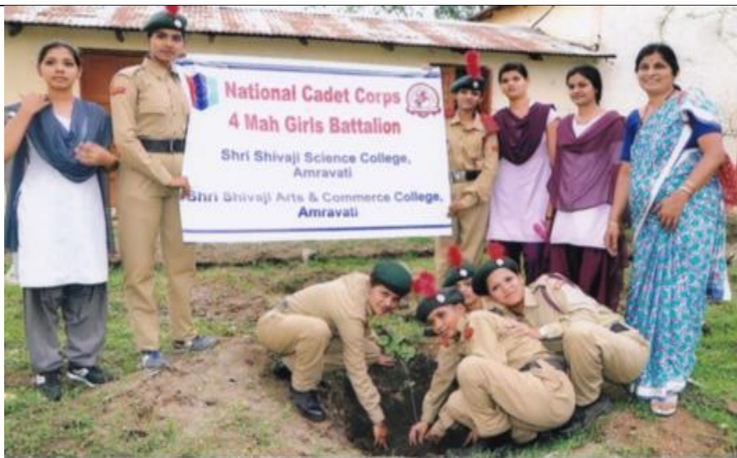
Tree Plantation at Tapovan (1/7/2016)

gulmohor, neem, bahumiya were planted by NCC cadets. Cadets also participated in discussion with the local people staying in Tapovan