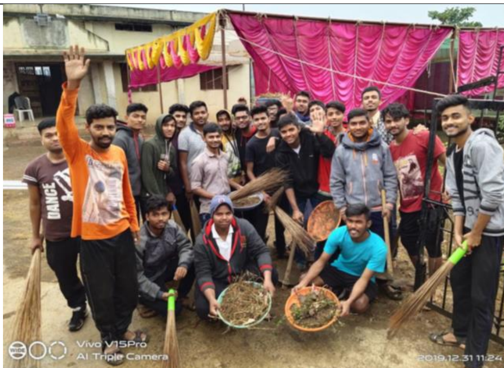
NSS Volunteers cleaning the village during the Special NSS Camp at Kamunja on 30 December, 2019