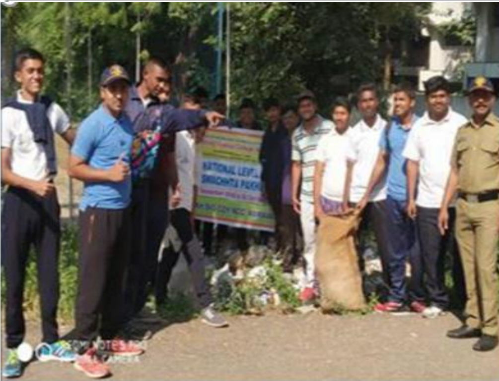
Swachh Bharat Abhiyan on the eve of Mahatma Gandhi Birth Anniversary 2017-18