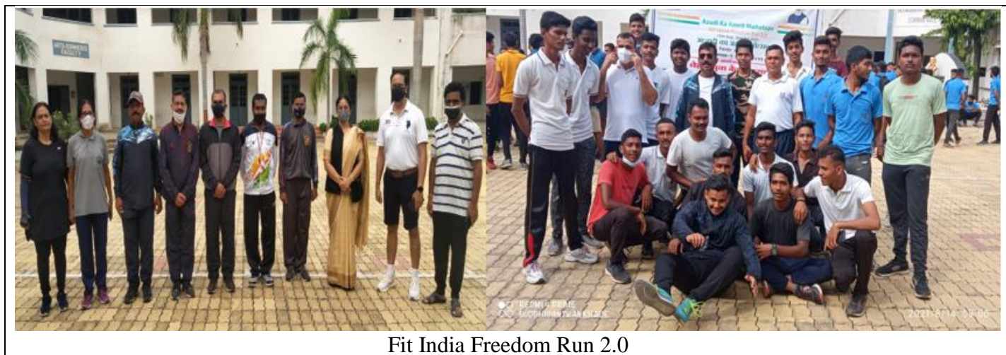
Fit India Freedom Run 2.0

The Fit India Freedom Run 2.0 was organized by NCC Amravati group for the NCC cadets. The twenty cadets from our college were participated in this run. The Fit India Freedom Run 2.0 run was inaugurated by Brig. S.N. Jha, Group Commandant NCC Amravati group. The run begin at Shivaji Arts College Amravati via NCC bhavan, Girls high school square and end at same venue. The total 4.2 km run was completed by the cadets from all BNs and Company.