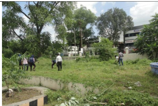
NSS Volunteers cleaning the Amravati Railway Station Campus