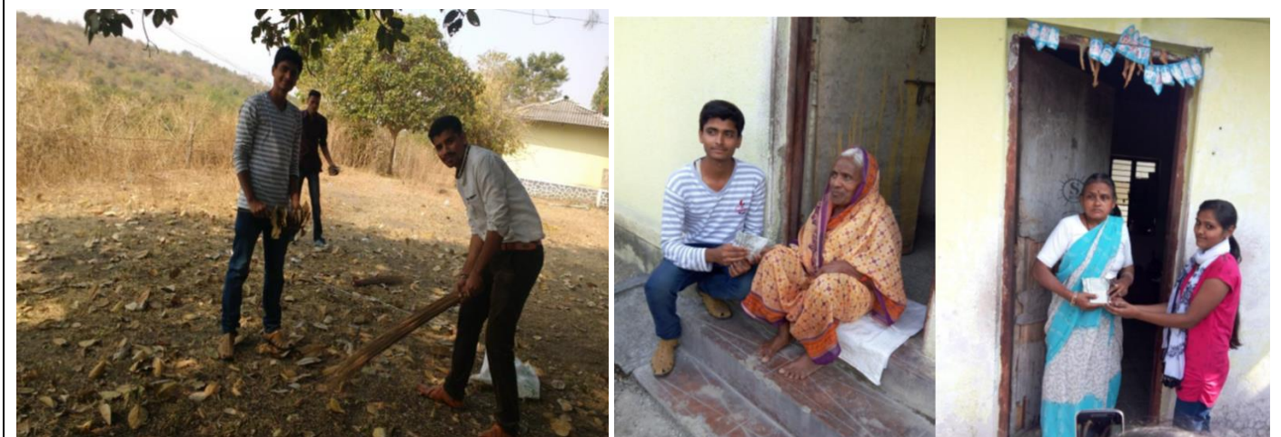
NSS Volunteers cleaning the Matoshri Old Age Home, Bhankheda, Amravati and distributing essentials to the old residents on 02 October, 2016