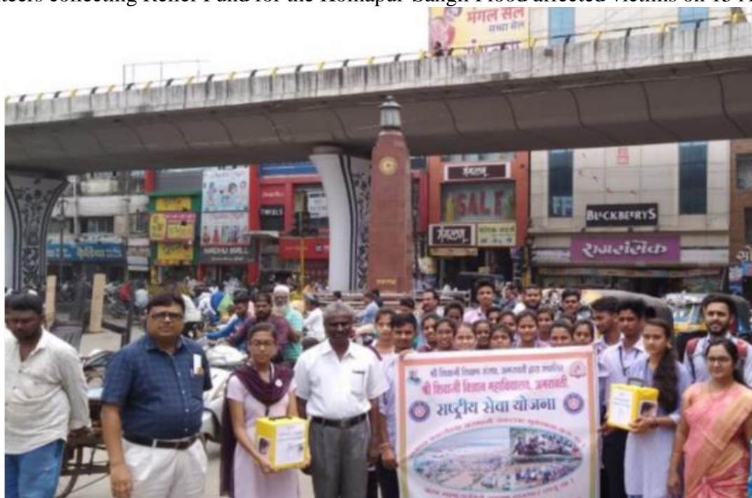
NSS Volunteers collecting Relief Fund for the Kolhapur-Sangli Flood affected victims on 15 August,2019