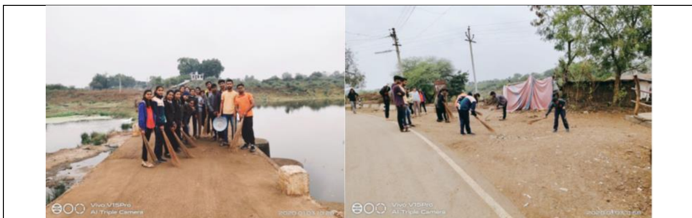
NSS Volunteers cleaning the village during the Special NSS Camp at Kamunja on 30 December, 2019