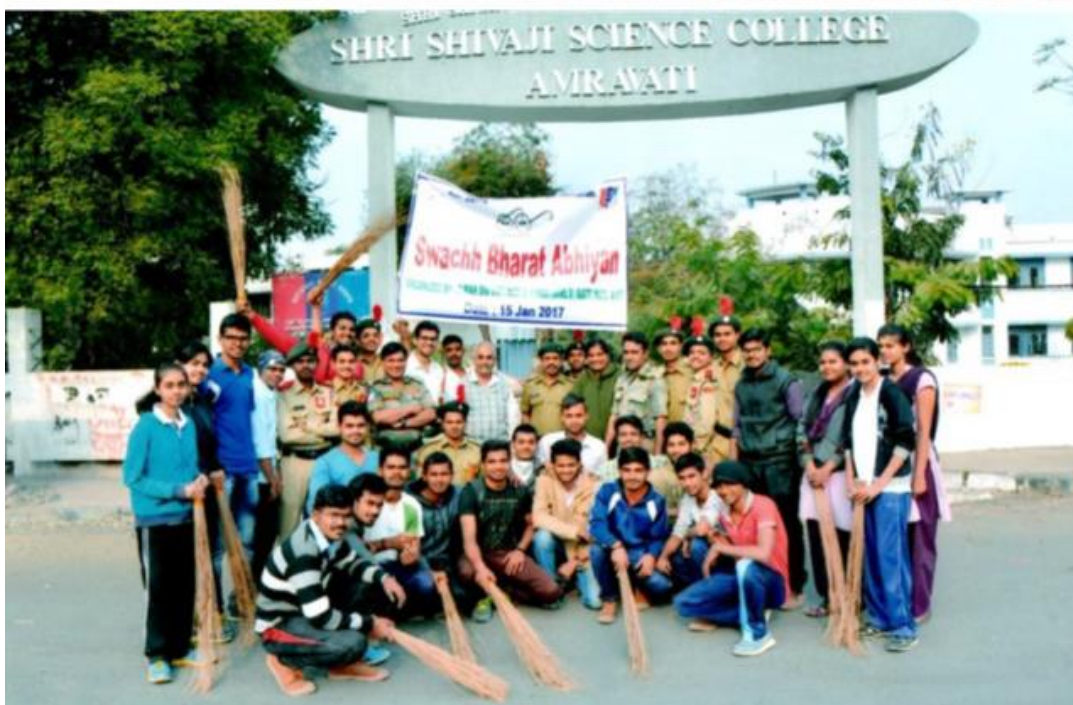
Swachh Bharat Abhiyan 2016-17