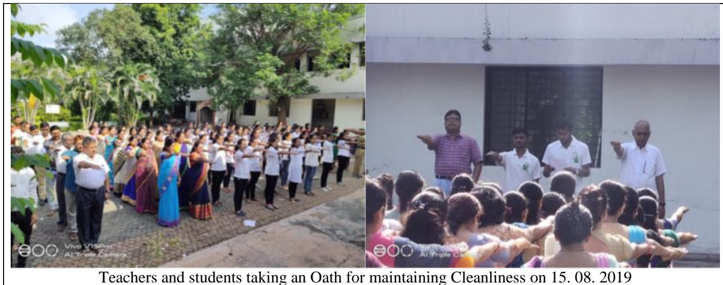
Teachers and students taking an Oath for maintaining Cleanliness on 15. 08. 2019

Mission on cleanliness “Swachh Bharat Abhiyan” was celebrated from 1st to 15th August, 2019, on this occasion the entire college campus was cleaned by the NSS volunteers and the oath of cleanliness was taken under the Swachh Bharat Swachh Bharat Campaign.