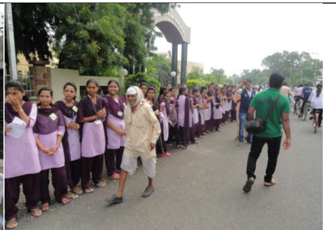
Lokjagar & Chetana Mohim- An initiative of the College NSS Unit in collaboration with the ‘Red Ribbon Club’ on 4 December, 2016.