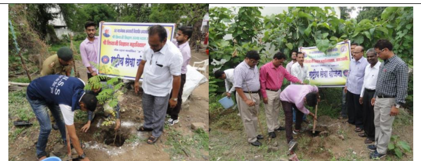
Teachers and students planting trees during the Tree Plantation Festival Programme