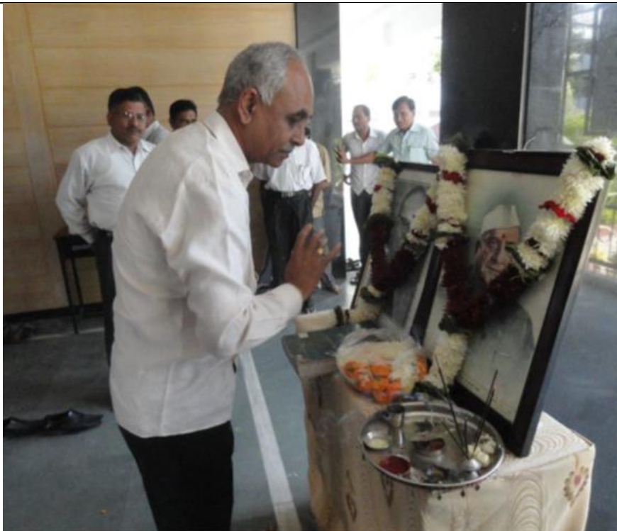
Constitution Day Celebration on Nov 26, 2016

The supreme constitution of India was dedicated to the nation on 26th November 1949. Constitution day was celebrated on Nov 26, 2016 and the preamble of constitution of India was read by the NSS students.