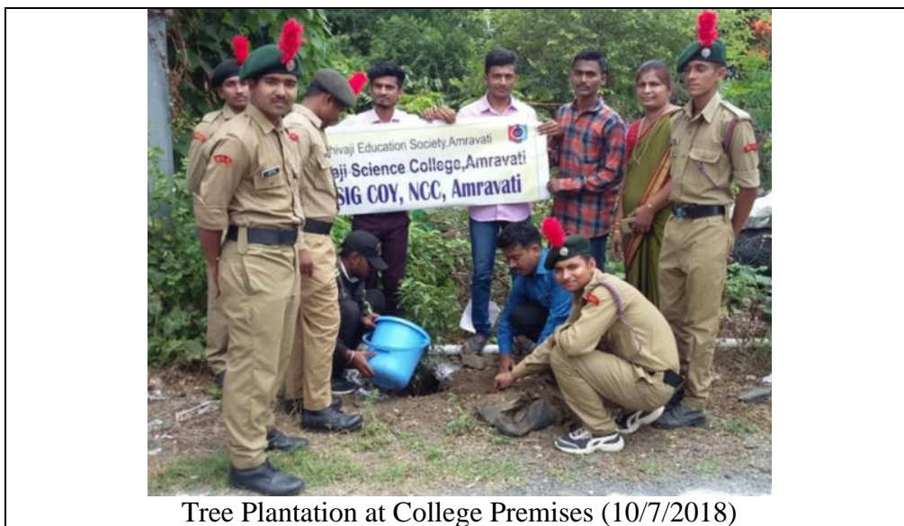
Tree Plantation at College Premises (10/7/2018)

The tree plantation program was organized jointly by NCC, NSS and environmental Cell of the college. Nearly twenty plants of different varieties were planted at Basketball ground of Shri Shivaji College, Amravati. The Principal and other staff planted trees on this occasion. The NCC cadets actively participated in tree Plantation.