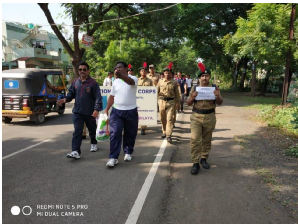
Swachh Bharat Abhiyan Rally 2017-18 (16th Sept 2017)