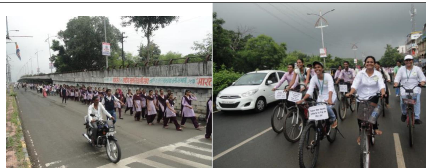
AIDS Awareness Rally by NSS Volunteers on the World AIDS Day, 01 December, 2017

AIDS Awareness Rally was organised by the college NSS Volunteers on the World AIDS Day, 01 December, 2017. A large number of students of the college participated in the Rally and made awareness about this ghastly disease in the society by carrying slogans and messages for the same.