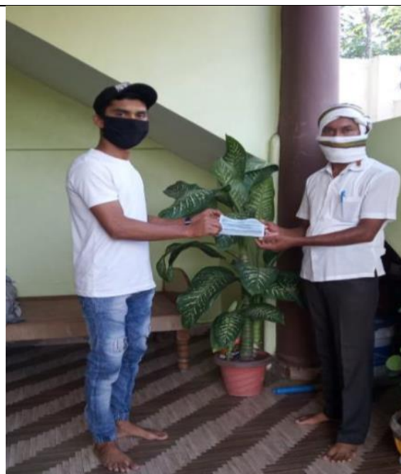
NSS Volunteers distributing Masks and sanitizers during the Covid-19 pandemic

https://www.youtube.com/watch?v=FMqXSd17N88