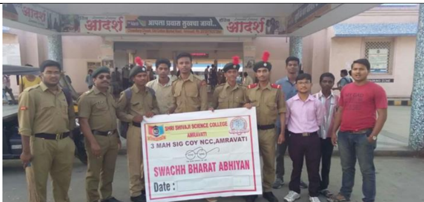
Swachh Bharat Abhiyan at Railway station Amravati (02/10/17)

On the eve of Mahatma Gandhi Birth Anniversary, the cadets performed the street play at Rajkamal Chowk at 5.00 pm along with 4 MAH GIRLS BN NCC, Amravati. Earlier, the cadets did shramadan under the Swachh Bharat Abhiyan at Railway Station Amravati.