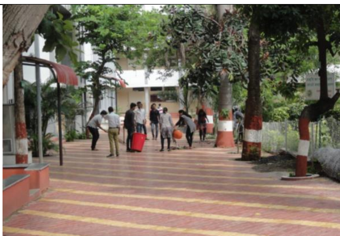
1st to 15th August, 2016 “Swachh Bharat Abhiyan” celebration by cleaning college campus

From 1st to 15th August, 2016 “Swachh Bharat Abhiyan” was celebrated and during this period the entire college campus was cleaned by the NSS volunteers and the oath of cleanliness was taken under the Swachh Bharat campaign.