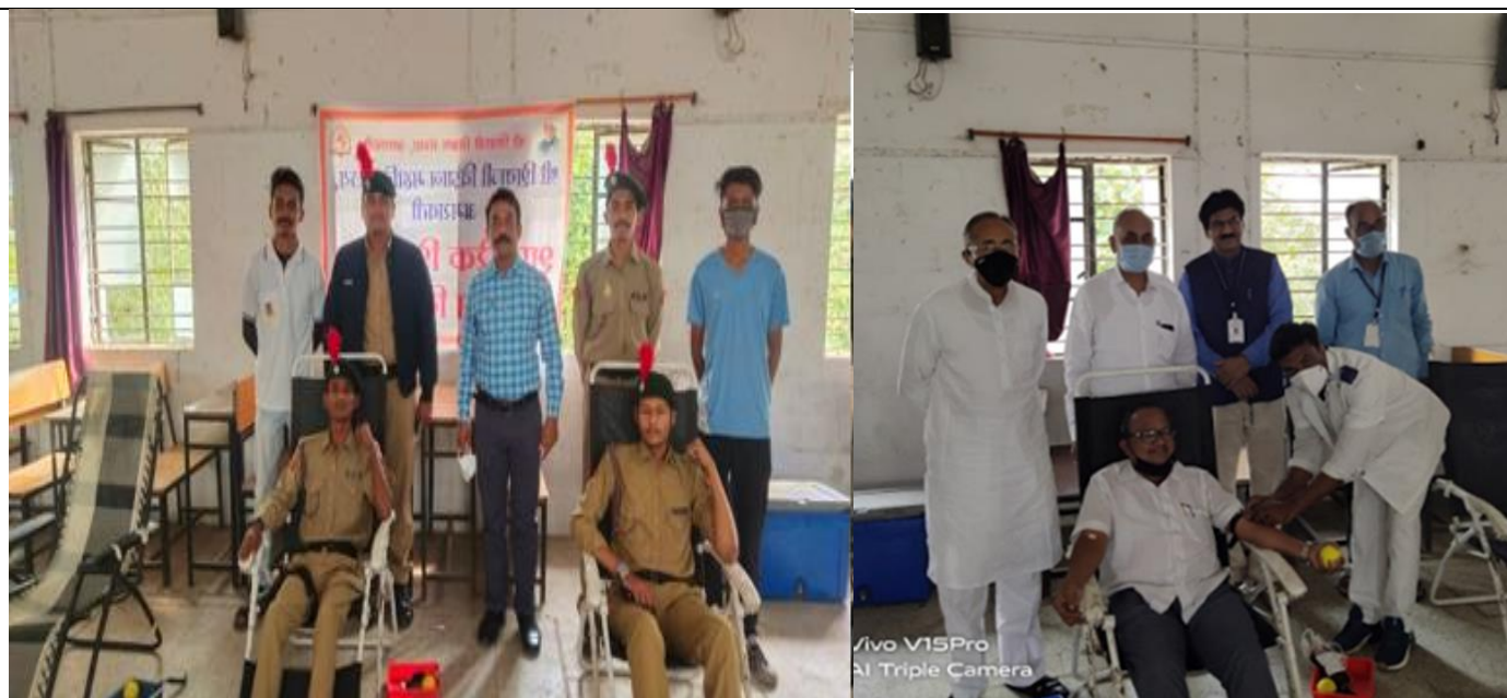
NCC cadets and College staff donating blood in Blood Donation Camp (12/12/2020)

Impact: Blood donation is definitely a noble act. Many clinics and hospitals constantly require blood for several purposes. This makes the idea of blood donation a noble gesture as it provides life-saving help to people and patients. On an average, human body contains approximately four to five litres blood that can be donated after every third month for men and every four months for women and this awareness created by arranging such camps.