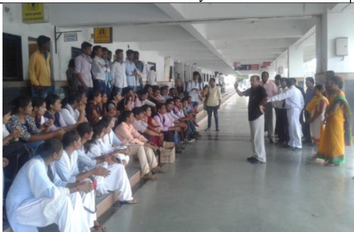
NSS Programme Officers guiding the NSS Volunteers during the Cleanliness Drive at Amravati Railway Station