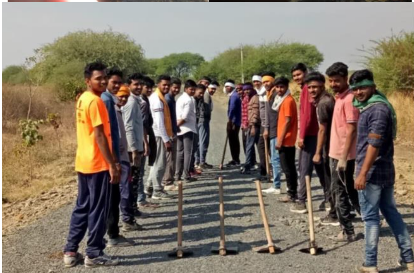
Cleanliness Drive at NSS Special Camp at 'Naya Akola'