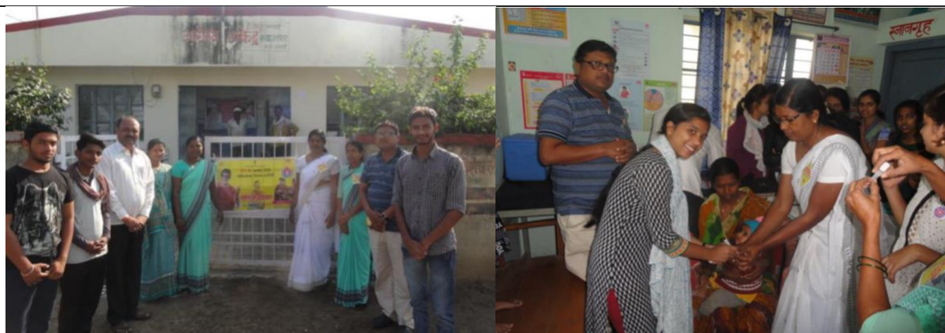
NSS Volunteers helping the Health Workers during the Pulse-Polio Immunisation Programme at the Primary Health Center, Naya Aloka

As a social responsibility, NSS Volunteers helped the Health Workers during the Pulse-Polio Immunisation Programme at the Primary Health Center, Naya Aloka on 29 January, 2018