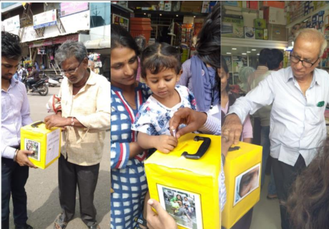
NSS Volunteers collecting Relief Fund for the Kolhapur-Sangli Flood affected victims on 15 August,2019

On 15th August 2019, NSS students marched a rally and collected Rs. 25,000 for the Kolhapur Sangali flood victims and deposited it in the Chief Minister’s Assistance Fund.