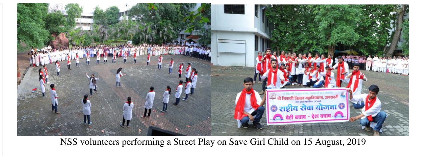
NSS volunteers performing a Street Play on Save Girl Child on 15 August, 2019

NSS volunteers performed a Street Play on Save Girl Child on 15 August, 2019. Through this street play, the spectators were enlightened to cherish gender equality in the society and also eradicate the sub status of girls in the society.