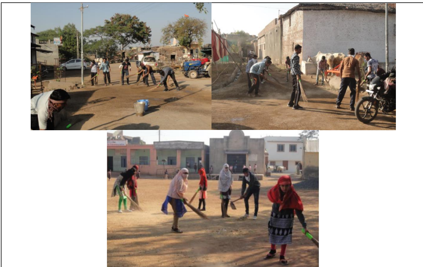
NSS Volunteers during the Cleanliness Drive at Naya Alola, an adopted village of the college

The National Service Scheme Special Camp of Shri Shivaji Science College, Amravati was conducted between 24/01/2018 to 31/01/2018 at 'Naya Akola', the adopted village by the college. During the seven days NSS Camp, the students cleaned the village every day and also oriented the villagers about maintaining cleanliness and its importance in keeping good health.