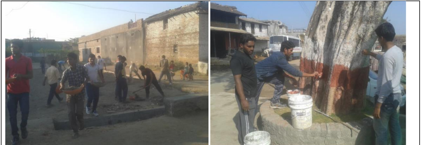
Cleanliness Campaign by the NSS Volunteers at the Akoli Railway Station, Amravati on 2 October, 2016

Special Camp of Shri Shivaji Science College, Amravati under National Service Scheme was conducted between 25/12/2016 to 01/01/2017 at Naya Akola, the adopted village by the college.