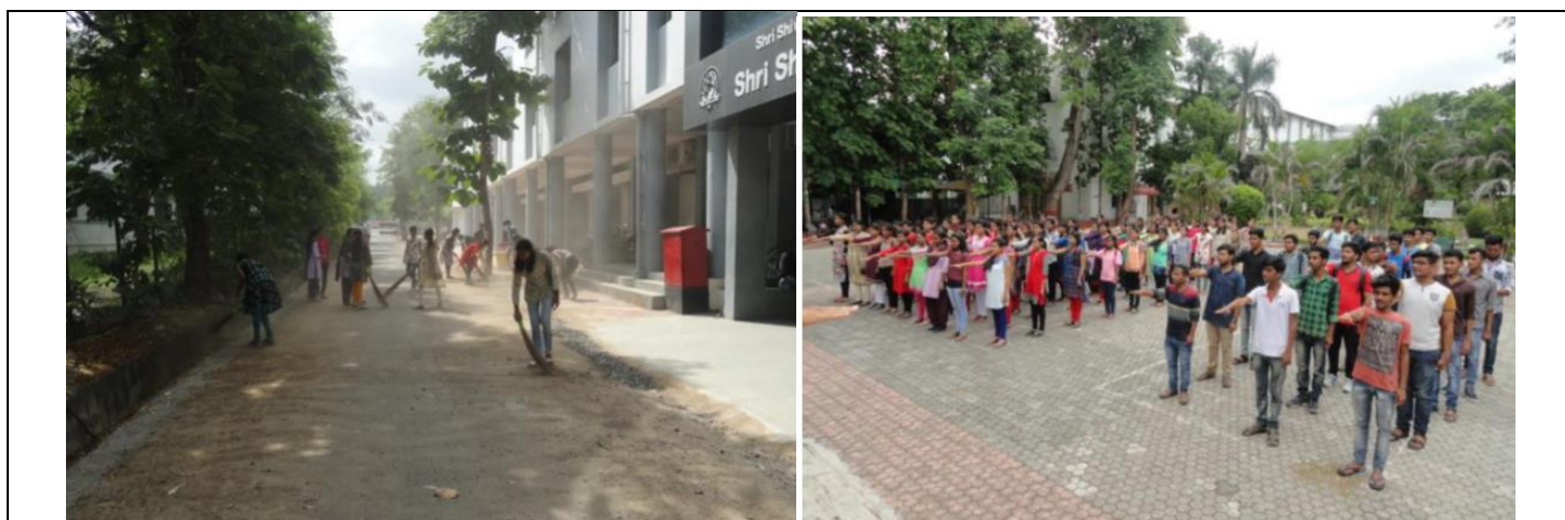
Swachh Bharat Abhiyan College Campus cleaning and Oath taking for cleanness by NSS Volunteers