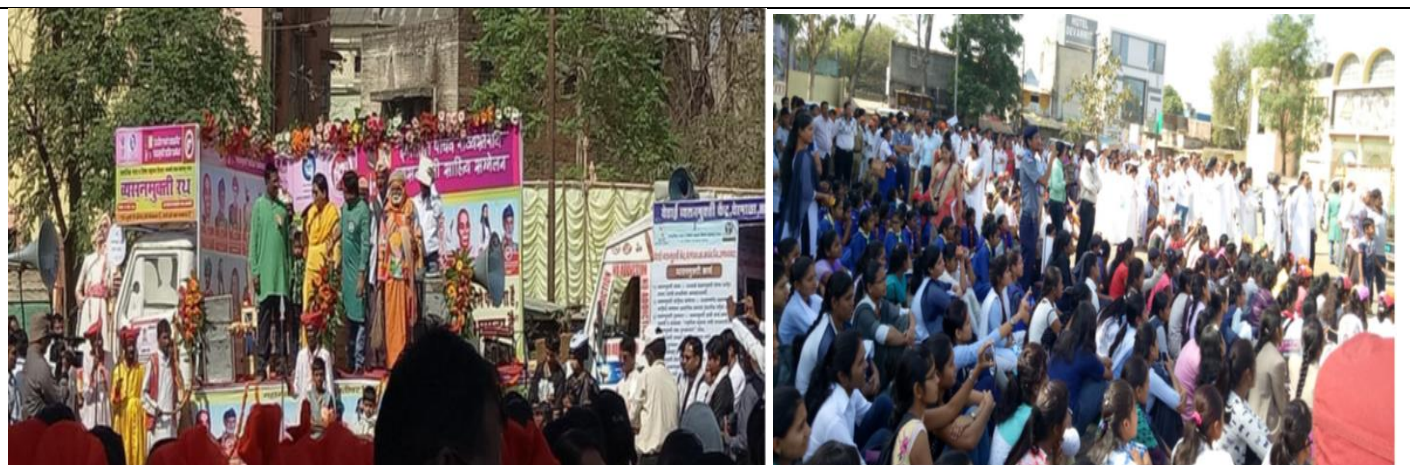
NSS Volunteers assembled for the Rally organised by the College for the De-Addiction from hazardous drugs at Nehru Maidan, Amravati 17 March, 2017

A Rally was organised by the College for the De-Addiction from hazardous drugs at Nehru Maidan, Amravati 17 March, 2017