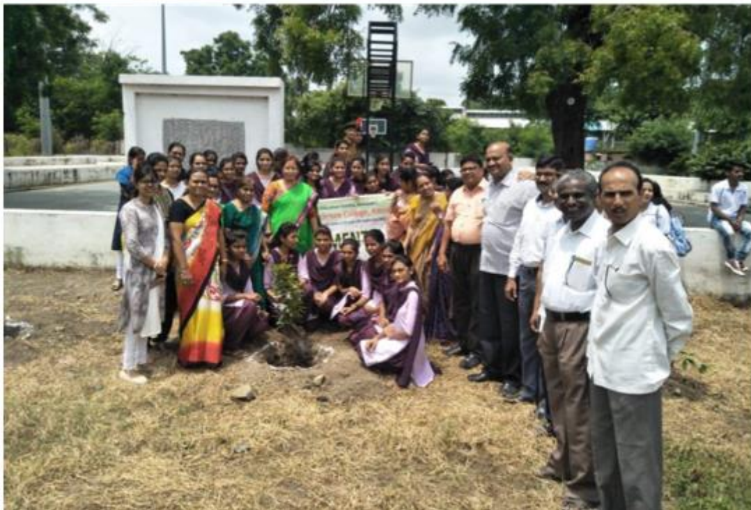
Tree plantation activity on 15th August by the PG students of the college