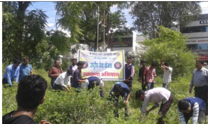
Congress Grass Eradication Drive by NSS Volunteers at the Amravati Railway station