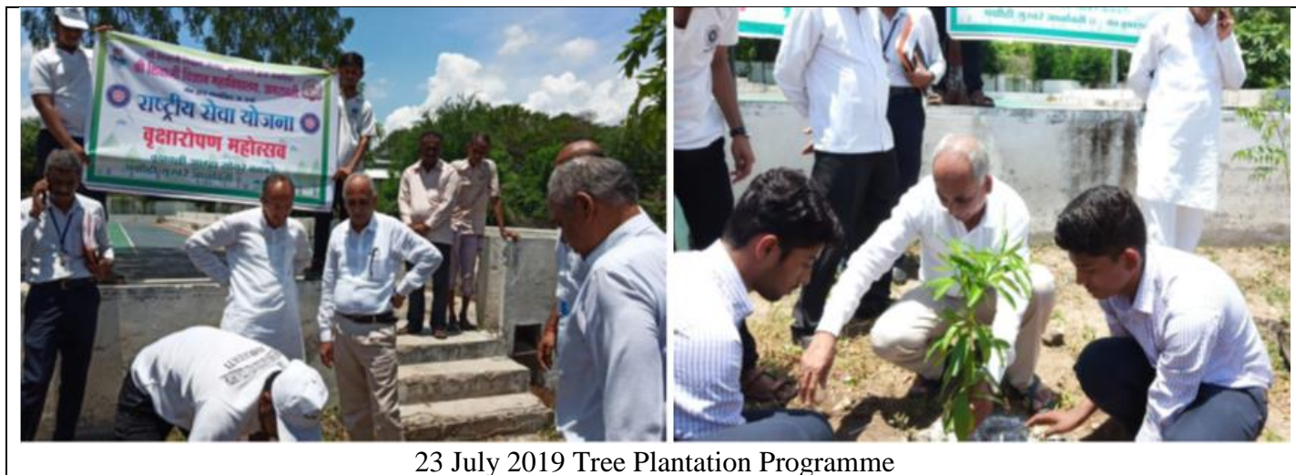
23 July 2019 Tree Plantation Programme