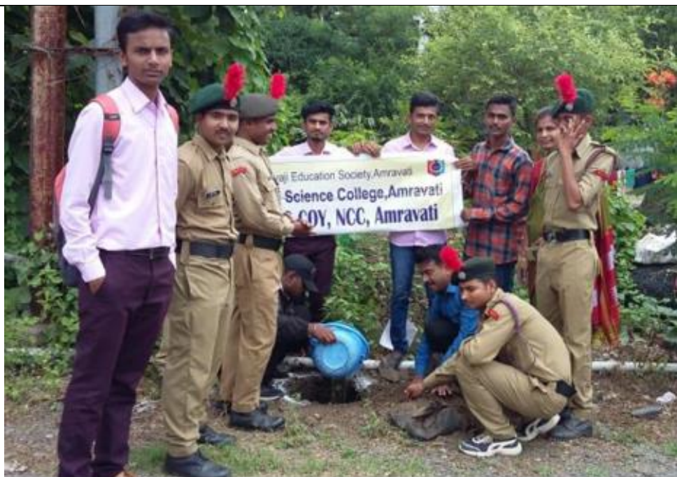
Tree Plantation at College (5th June 2017)