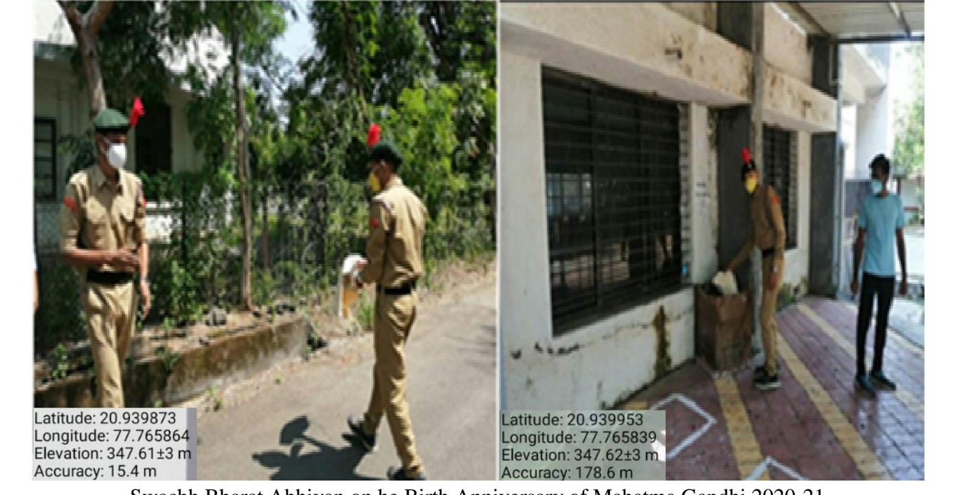
Swachh Bharat Abhiyan on he Birth Anniversary of Mahatma Gandhi 2020-21

On the eve of 151<sup>th</sup> Birth Anniversary of Mahatma Gandhi the Swachh Bharat Abhiyan was organized in college campus. Due to COVID Pandemic very few cadets were present for the cleaning college campus. The plastic bottles, litters were collected. Fifteen cadets were participated in this activity.