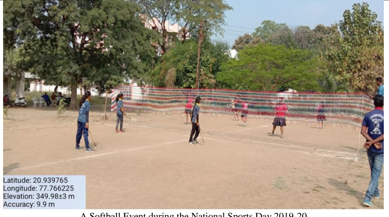
A Softball Event during the National Sports Day 2019-20