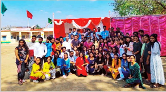
रासेयो शिविर पथक