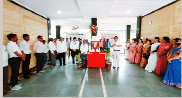
डॉ. बाबासाहेब आंबेडकर जयंती