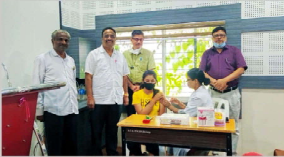
कोरोना लसिकरण शिविर