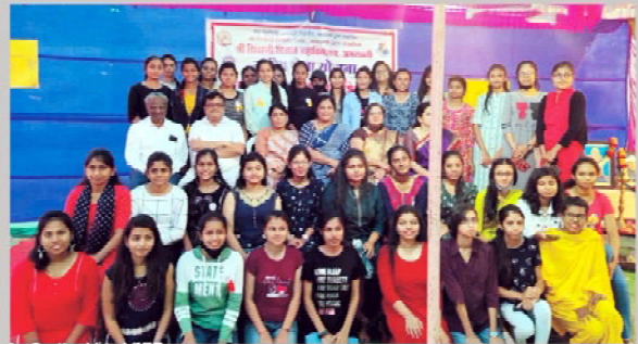
स्त्री सबलीकरण कार्यक्रम