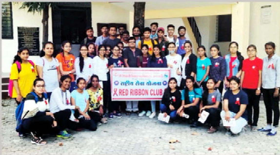
रेड रिबन क्लब कार्यक्रम