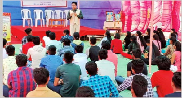
व्यक्तीमत्व विकास कार्यशाळा