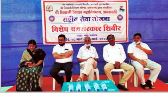
रासेयो शिविर उद्घाटन समारंभ, नया अकोला