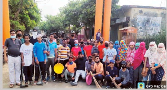
स्वच्छ भारत अभियान