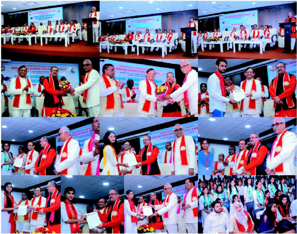
Degree - Distribution Ceremony, Summer-2019