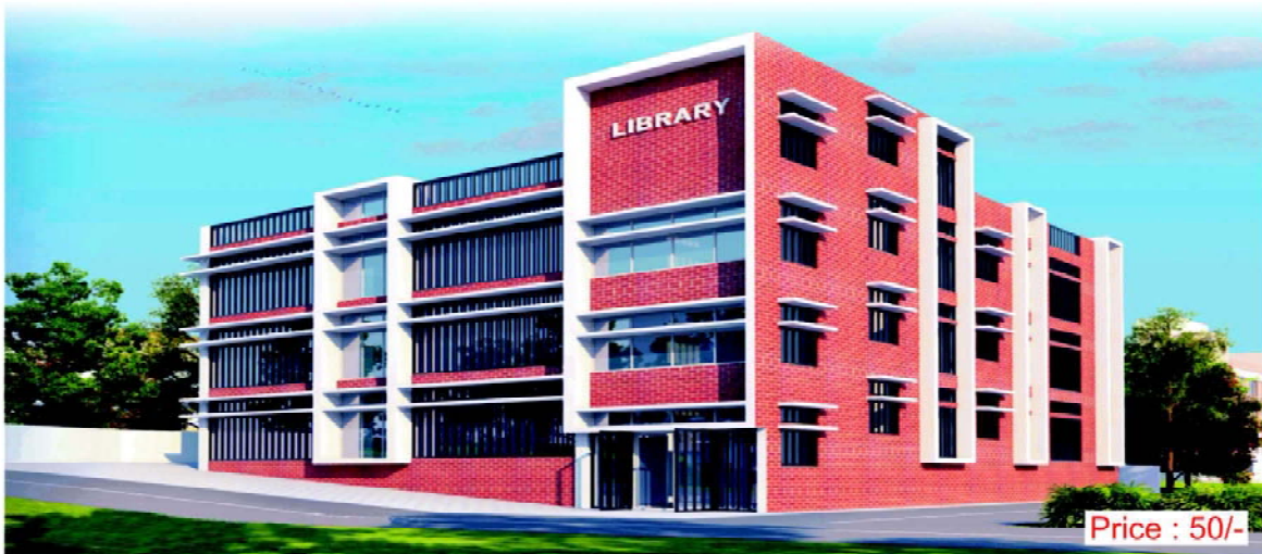
Proposed Library Building