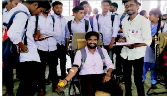
रासेयो रक्तदान शिबिर