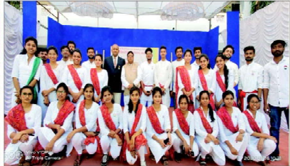
प्रजासत्ताक दिन निमित्त नृत्य चमू