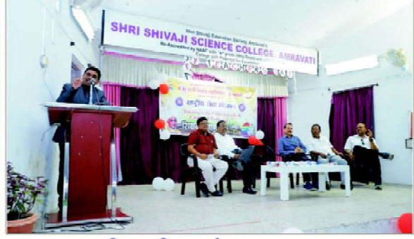
शिक्षक दिन कार्यक्रम