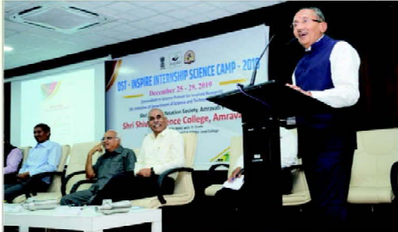
Inauguration of "Inspire Camp"