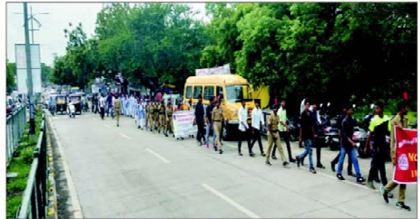
A mass rally on the eve of "Kargil Vijay Diwas"