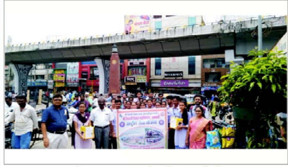
कोल्हापूर पुरग्रस्तांसाठी मदत फेरी