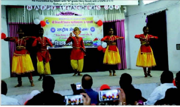
रासेयो सांस्कृतिक कार्यक्रम