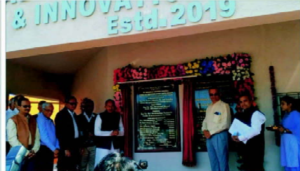
Inauguration at the hands of Dr. Anil Kakodkar, Former Chairman (Atomic Energy Commission)