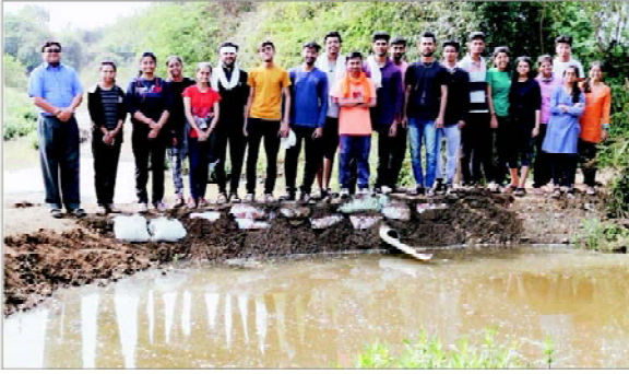
रासेयो तर्फे बंधारा व जलसंवर्धन कार्यक्रम