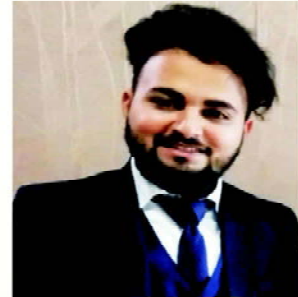
Kaushal Kale Fine Arts