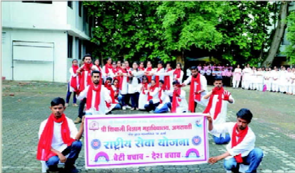
रासेयो बेटी बचाव देश बचाव पथनाट्य