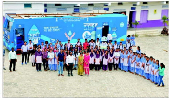
Jaldut Abhiyan at school org. by Dept. Geology