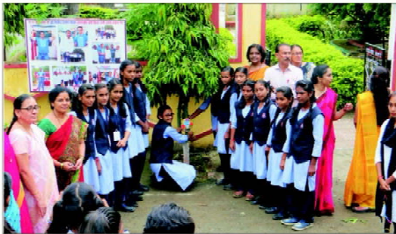
Science awareness programme org. by Dept. of Chemistry