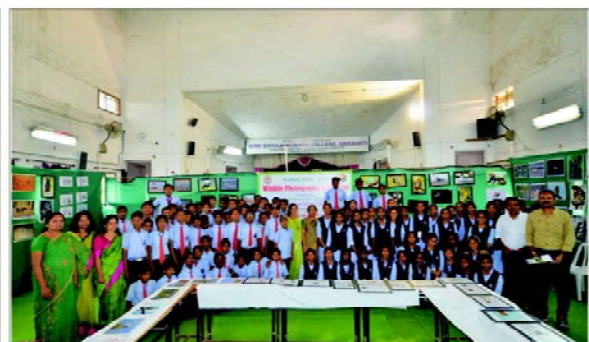
School Teachers and students visiting the wild life photo exhibition org. by Dept. of Zoology