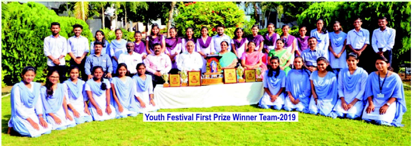
Youth Festival First Prize Winner Team-2019