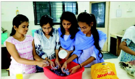
Ganpati Idol making from waste paper org. by Dept. of Env. Sci.