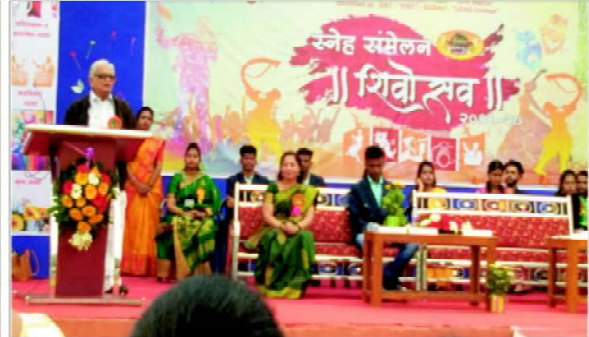
Inauguration of "Shivotsav"