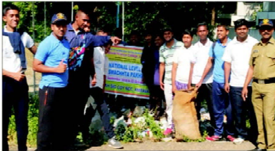
Swachh Bharat Abhiyan on the eve 150th Birth Anniversary of Mahatma Gandhi