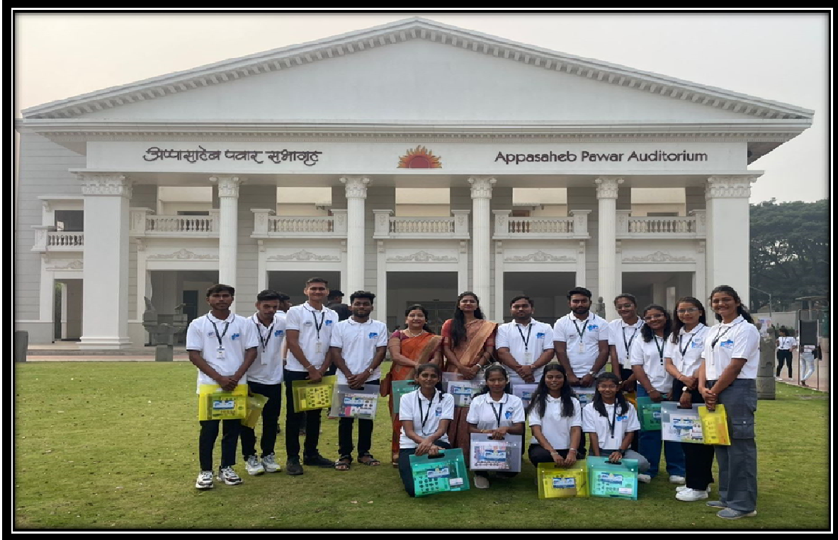
All the office bearers actively participated in the Career Parliament Convention held on 12 and 13 January 2025 at Sharadabai Pawar College, Baramati.