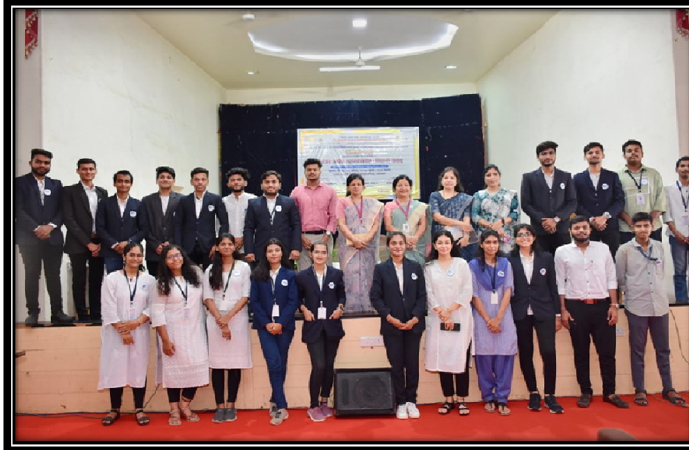
Ministers and Member of Career Sansad