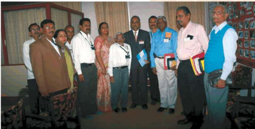
IQAC members with Peer Team members during PT visit of second cycle (2008)