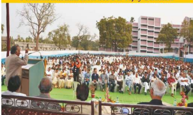
Dr. Vijay Bhatkar addressing the gathering of students and faculty of the college on 31 st January, 2012