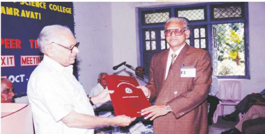
NAAC Peer Team Chairman handed over the report (First cycle of Accreditation - 2001)