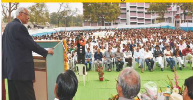
Dr. Raghunath Mashelkar addressing the gathering of students and faculty of the college on 31 st January, 2012