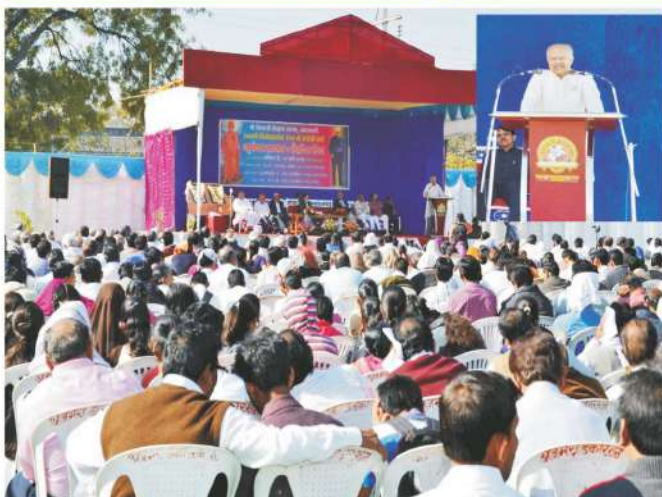
Dr. Jayant Naralikar addressing the gathering of students and faculty of the college on 12th January, 2013