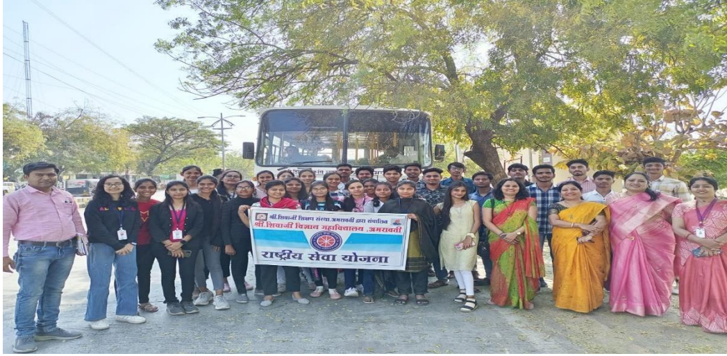
Glimpse of NSS camp at Shirala, Amravati