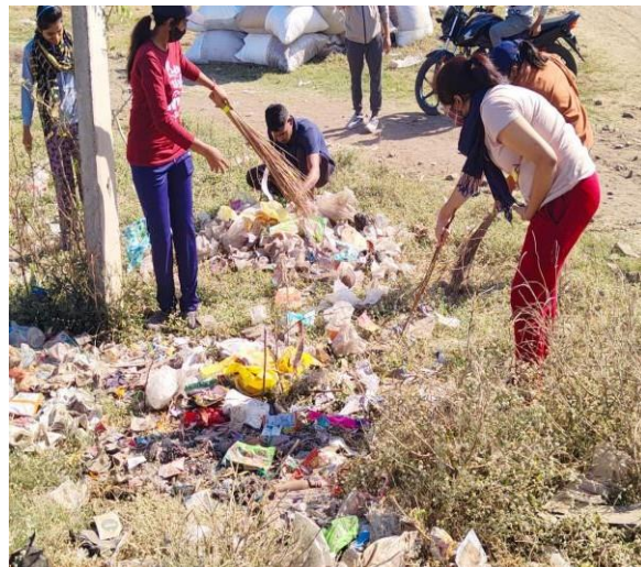
Glimpse of Cleanliness Drive