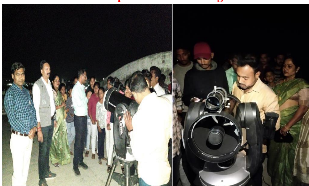
Glimpse of Skywatching