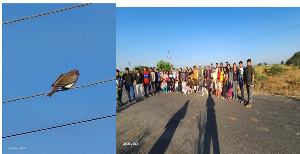
Glimpse of Bird Watching