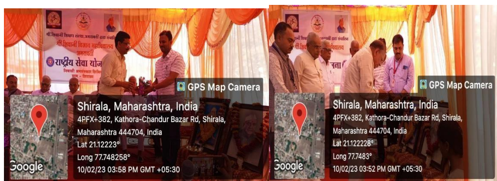
Glimpse Of Inauguration Program of “Shramasanskar Shibir”, Shirala