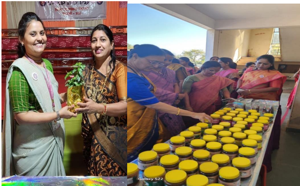
Glimpse of Bachatgat Program