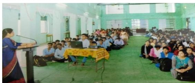
Intercollegiate Workshop on Eco-friendly Ganpati Making