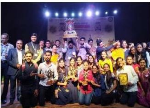
General Championship Trophy and the Winning Team