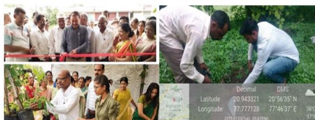
Tree plantation by participants