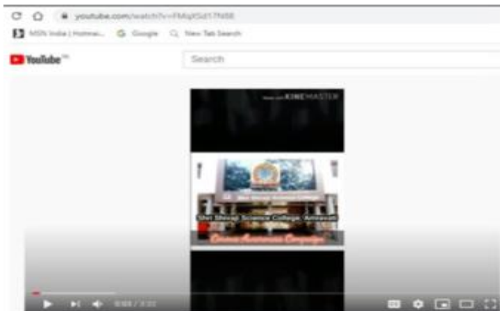
You-Tube Video prepared by the NSS Volunteers on Corona Awareness You-Tube Link-

During the Covid-19 pandemic lockdown, the NSS volunteers of the college prepared a You Tube Video to create awareness among the society regarding the ghastly spread of Corona Virus. They also distributed masks and sanitizers among the public.