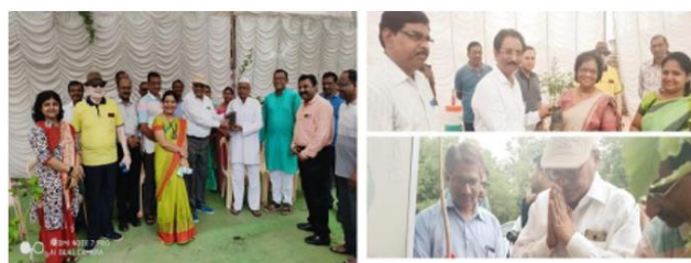
Inauguration at four different stalls by dignitaries

Superintendent of the Corporation and all the esteemed members of the Amravati Garden Club.