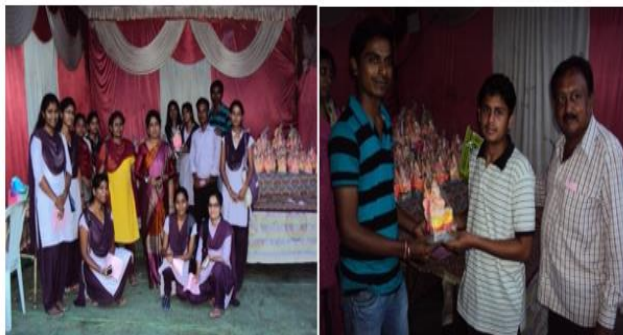
Students participated in the activity

On the occasion on Ganesh Chaturthi Students from the UG and PG Department of Environmental Science along with the Mungsaji Maharaj Organization participated in the awareness campaign for guiding and making people aware of the use of Ganesh idols prepared from mud and clay. On this occasion, the students motivated people to purchase these environmental-friendly Ganesh idols.