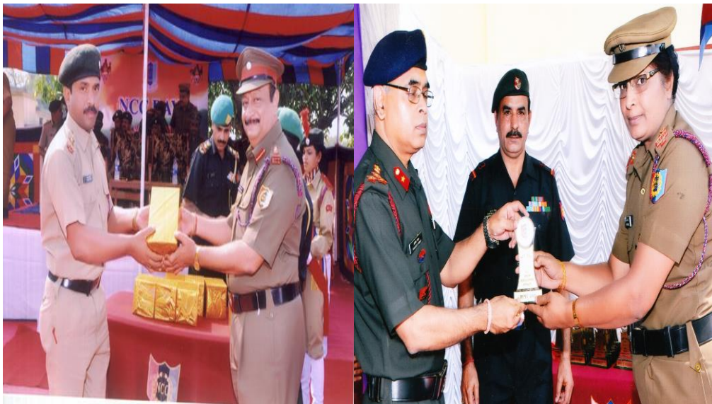
BEST ANO AWARD