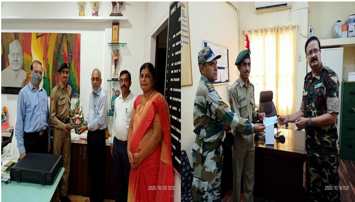
BSET CADETS SCHOLARSHIP