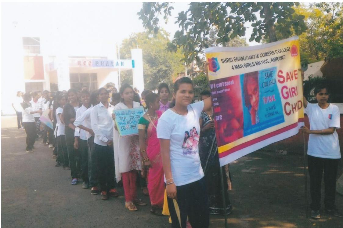
A mass Rally on Women's Day