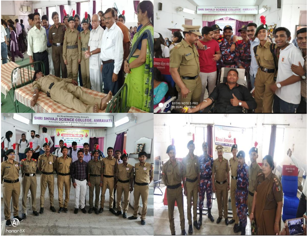
Blood Donation Camp Activity