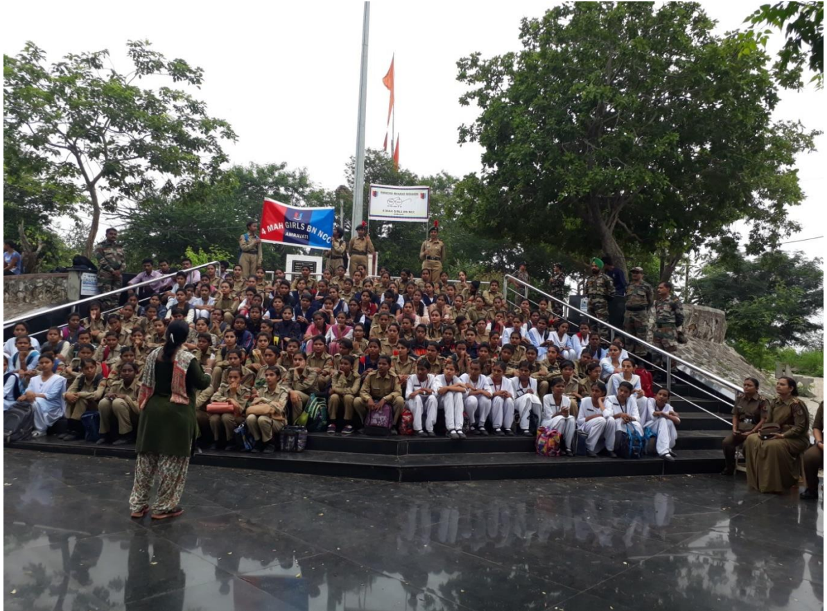
A program e- Cashless India