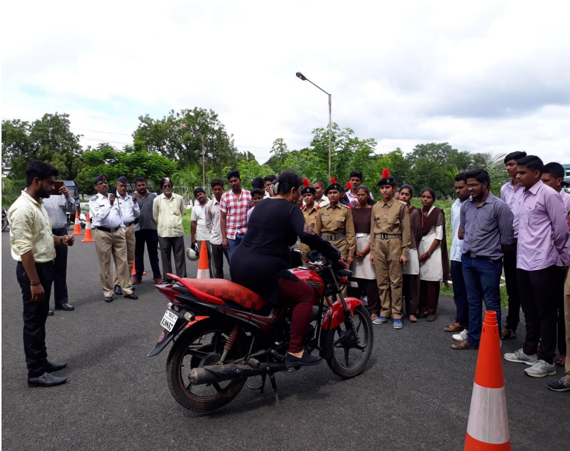
A Safe Driving -Road Safety Week (22/7/2017)

On 22 nd July 2017 a program of road safety was organized by NGO Speedy Safe of Mumbai, Amravati police commission rate, and collaboration with Shri Shivaji Science College, Amravati at 9.30 am early morning. Demonstration was given to 25 cadets by expert team about precautionary measure that should take while driving.