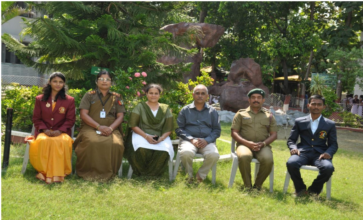
Felicitation of cadets by the Principal