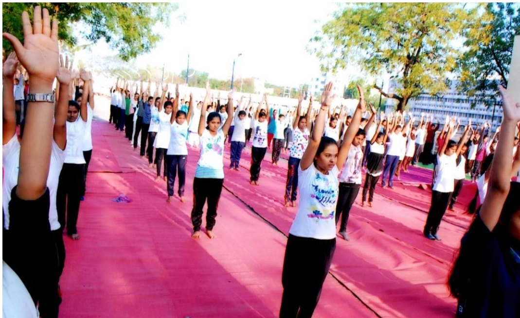
International Yoga Day (2017)