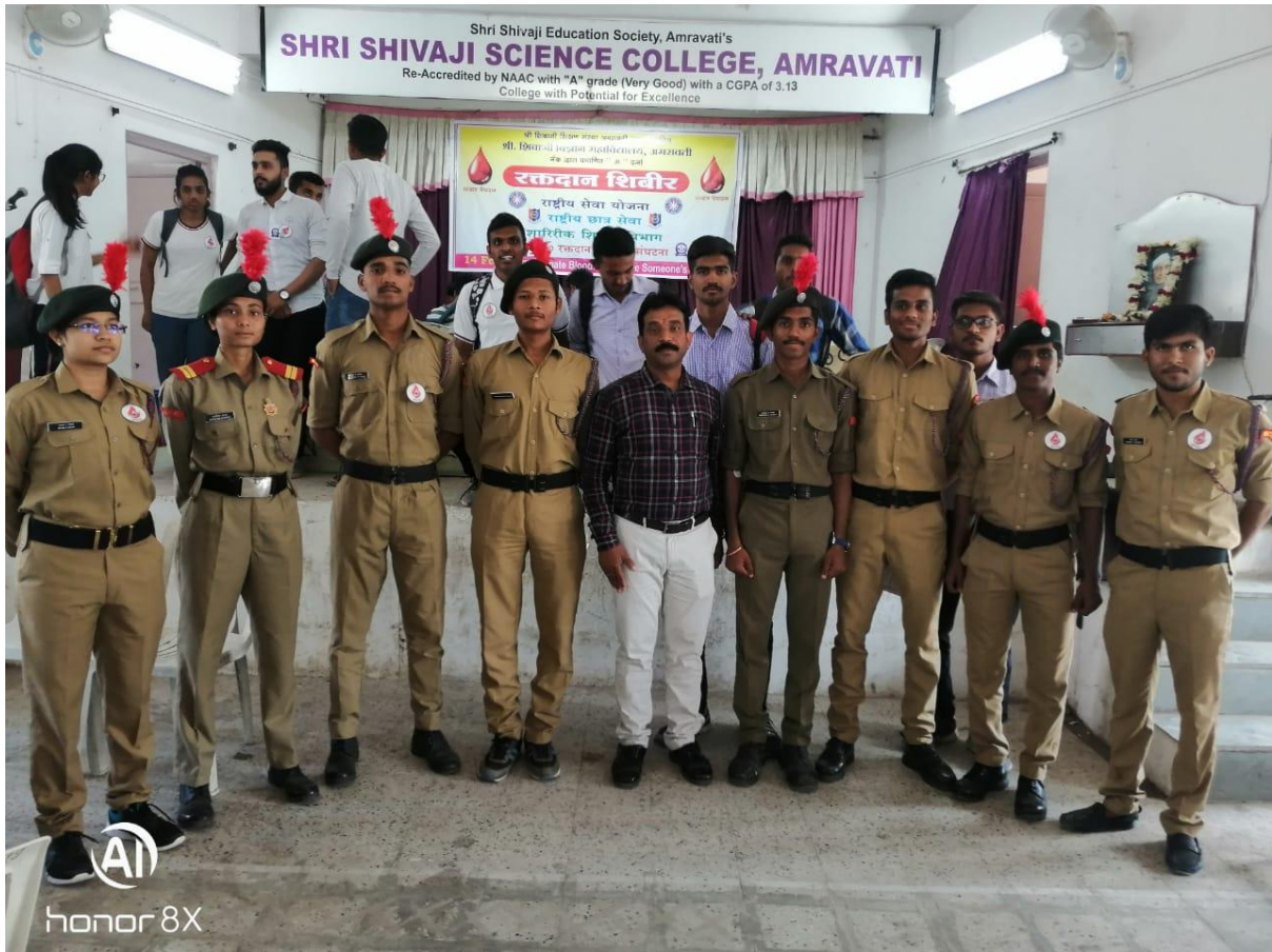
Blood Donation Camp (14/2/2020)

by the NCC cadets. The blood donors were given Samosa, banana, Biscuits and coffee after donating the blood in order to reenergize them. The blood donors were provided with a blood donation certificate card by Panjabrao Deshmukh Medical College, (PDMC) Amravati.