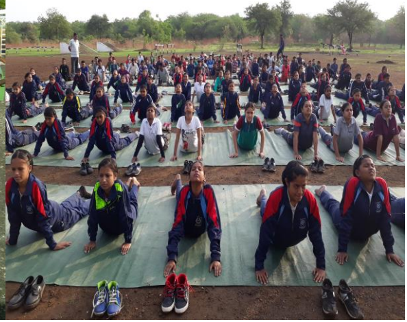
International Yoga Day (IYD)