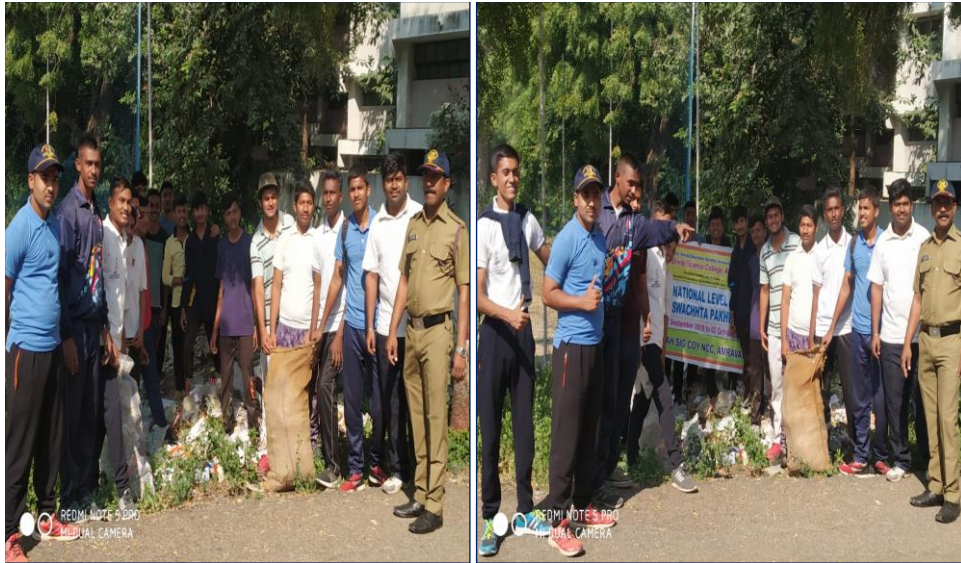
Swachh Bharat Abhiyan on the eve 150 th Birth Anniversary of Mahatma Gandhi