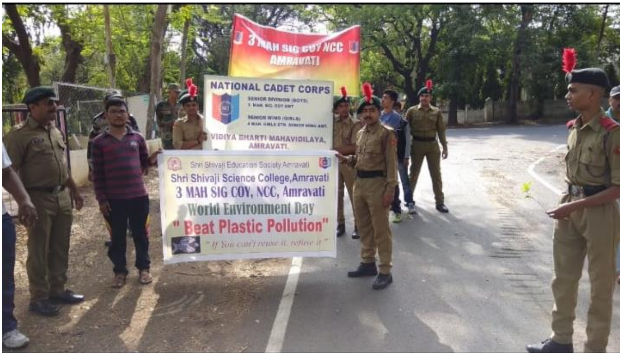
Beat Plastic Pollution Rally (5/6/2018)

All the premise of Vir Mangal Pandey Square was cleaned by cadets. Nearly 20 kg of plastic has been collected and disposed of. The cadets were also take part in rally with shouted slogan (awareness) up to Maltekadi.