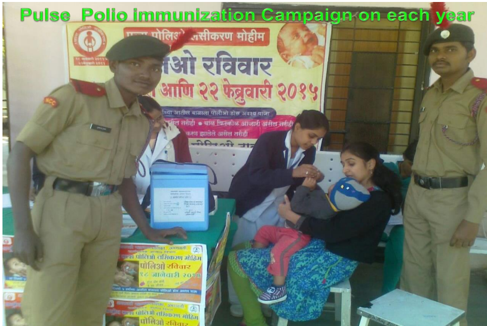
Pulse Polio Vaccination (22/2/2015)