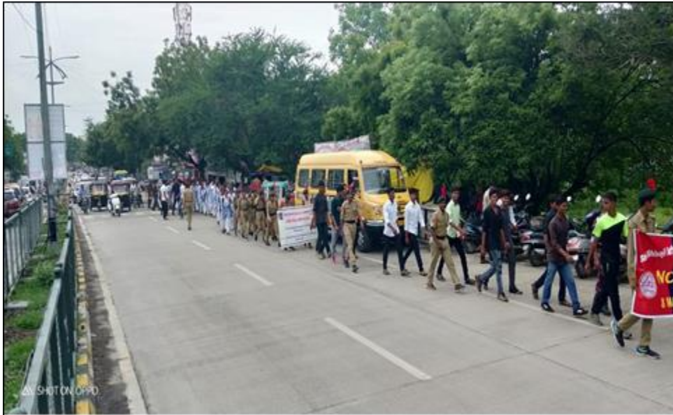
A mass rally on the eve of "Kargil Vijay Diwas"