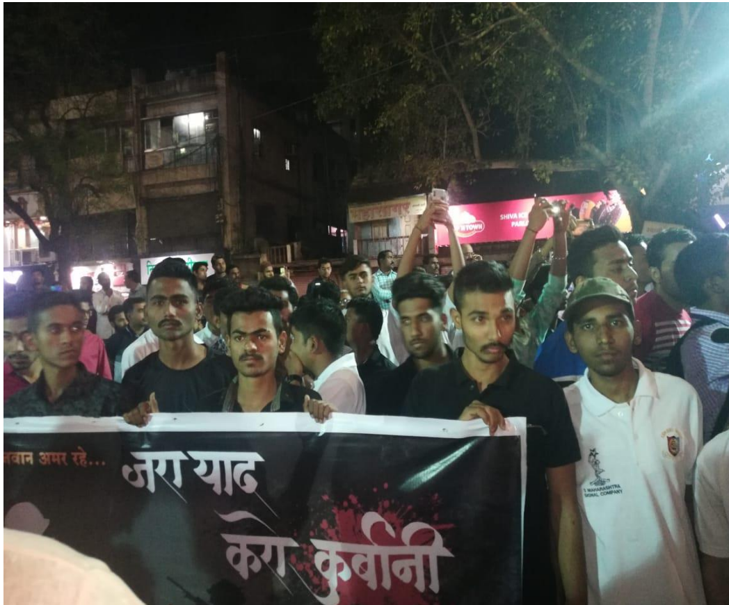
Candle March against Phulwama Attack (16/2/2019)

The candle light march started from Shri Shivaji Science College with raising slogan against Pakistan and terrorists upto Rajkamal Square Amravati. The NCC cadets, Hundreds of students including girls gathered at Rajkamal Square in Amravati demanding firm action on those responsible for attack