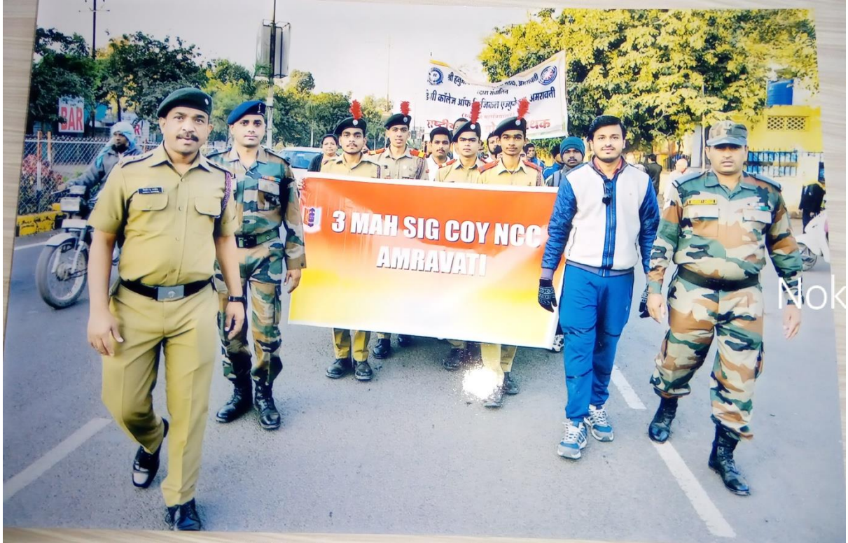
Beti Bachao Abhiyan Rally (02/01/2019)