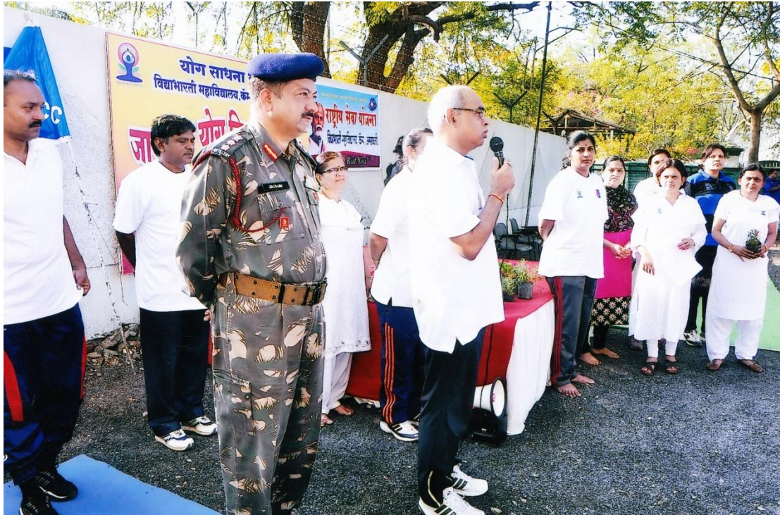
International Yoga Day (2017)