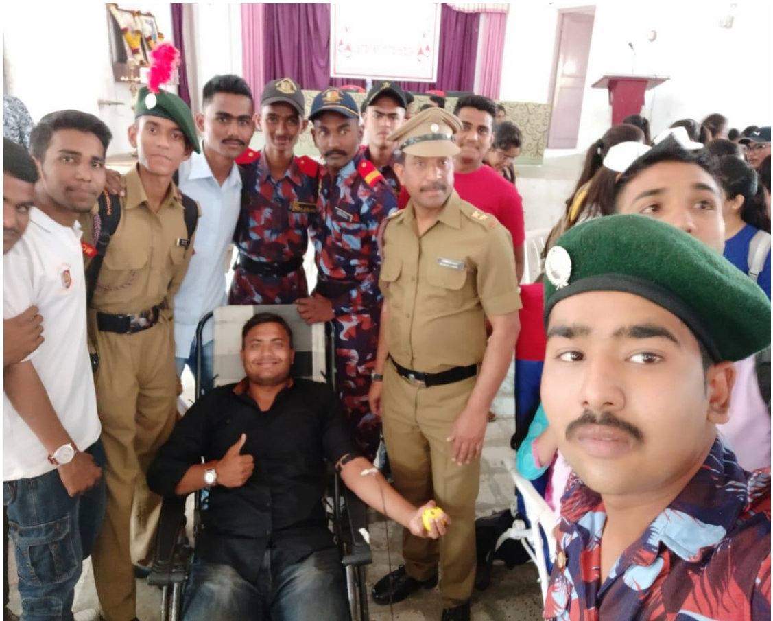
Blood Donation Camp (14/02/2019)

On the eve of Valentine day blood donation camp was organized by National Cadets Corps (NCC) and NSS unit of the college. Almost 22 cadets donated blood on this event. Each NCC cadets donated almost 450 ml of blood. The sacrifice and selfness character was imbibed in the cadet personality through such activity. The cadets and staff were actively participated in this activity.