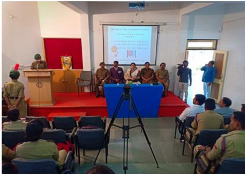
Guest lecture Organized the eve of "Kargil Vijay Diwas"