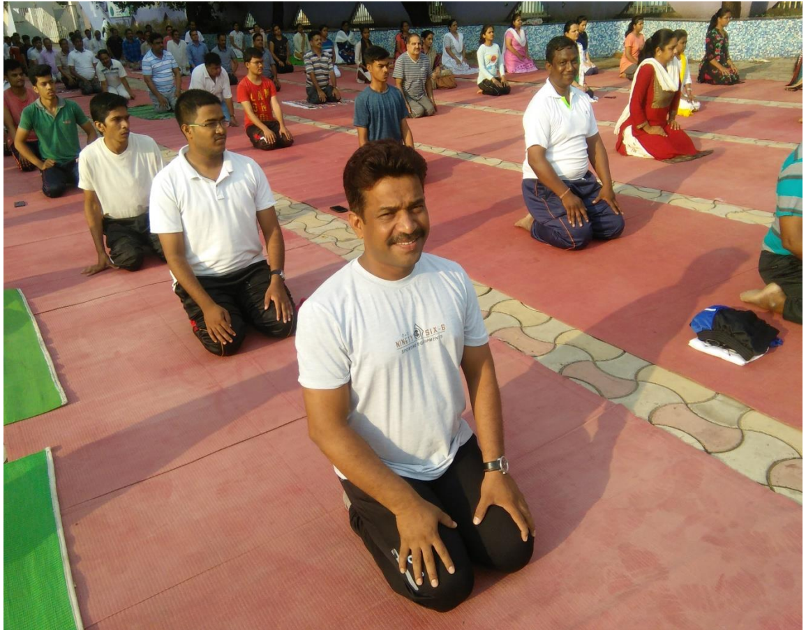
International Yoga Day (IYD-2016)